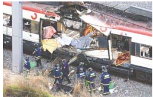
Rescue workers search the wreckage of a Madrid train on March 11, 2004

International terrorism, for now, represents a puny apocalypse. Mr. Bobbitt is as droll about this as anybody: since Sept. 11, "the total number of persons worldwide who have been killed by terrorists is about the same number as those who drowned in bathtubs in the US." But at any moment it -- IT -- could go from nothing to everything. After an untraceable mass-destructive strike on one of its cities, what political system would ever know itself again? And all other states would be unrecognizable too, as would relations between them.