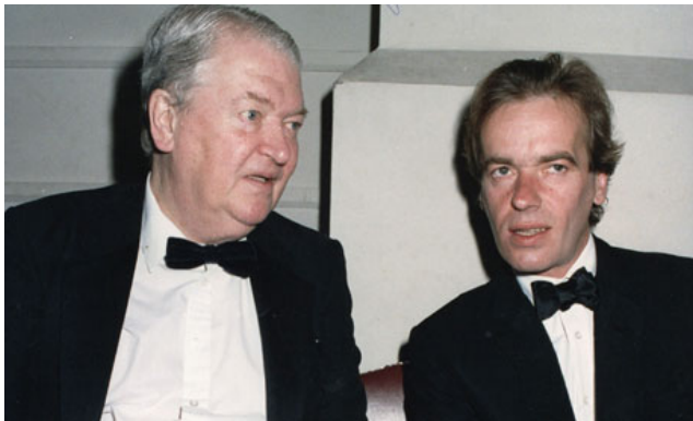
A way with words... Kingsley and Martin Amis in the 1990s.

Kingsley Amis was a lenient father. His paternal style, in the early years, can best be described as amiably minimalist – in other words, my mother did it all. It should be noted, though, that if I did come across him (before he slipped back into his study), he always said something that made me laugh or smile. This went a long way. And the humour usually derived from the originality of his phrasing. When I was 16 or 17, and started reading books for grown-ups, I became, in his eyes, worth talking to. And when, six or seven years later, I started using the English language in the literary pages of the newspapers, I became worth correcting. I was in my early-middle 20s; my father was still amiable, but he was lenient no longer.