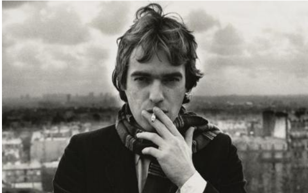
Martin Amis, Paris, 1980

It was the beginning of 1974. I was 21, living with my journalist boyfriend in his South Kensington flat, and working as London editor of the American fashion bible Women's Wear Daily and its more glamorous big sister W . One of my earliest feature ideas was a profile of "London's newest novelist", whose first book The Rachel Papers was due to be published in America in the spring.