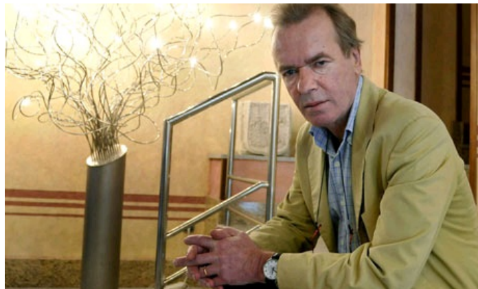
'I'm a gynocrat'... Martin Amis.