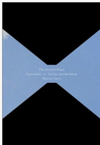
The cover of Martin Amis's The Second Plane: September 11: Terror and Boredom.

A: It's mixed the picture up a bit. [The book] got pretty even-handed treatment here [in Britain], and it seems more fierce in America. I think there's a fair bit of proprietoriality [in reviews by American critics]: this is our event, this is our territory, and we don't want someone else wading in; our wounds are too tender for that.