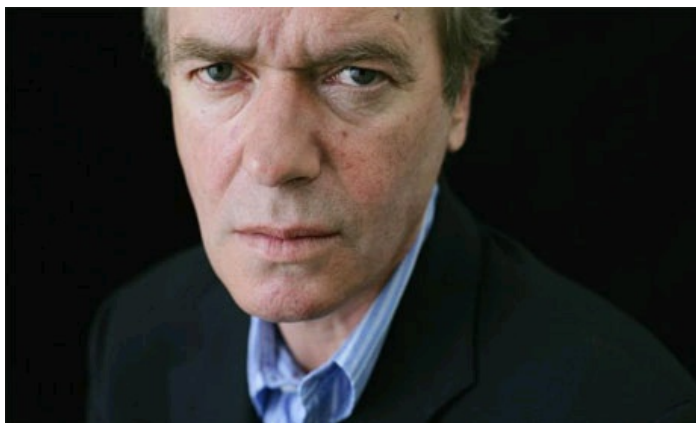
Practising 'the spooky art'... Martin Amis.

Martin Amis The Guardian, Saturday 23 January 2010 Article history