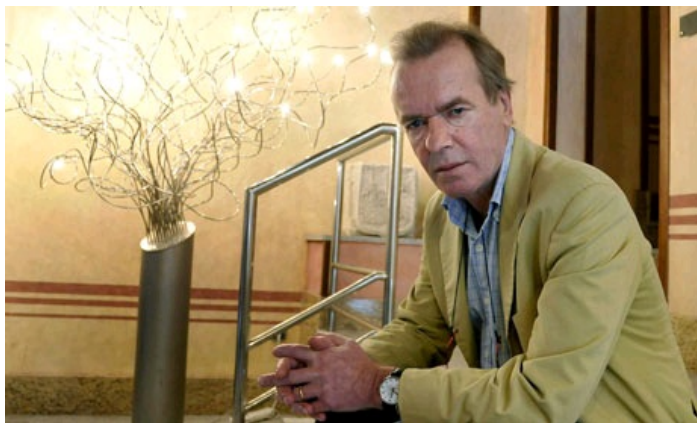
Martin Amis.

Tod T Friendly, doctor and sometime philanderer, is a man whose inner self seems hidden from his passing conquests. "I don't feel I really know you," (or something similar) they say. His longtime girlfriend has an old word for what seems absent. "Perhaps Irene puts it best – she certainly puts it most often – when she tells Tod that he has no soul." Amis's protagonist, revealed in the novel's reverse chronology to have been a Nazi doctor called Odilo Unverdorben in his previous life, has no known inner life. We do not get told his thoughts. But he does have a soul. For the novel is narrated, in the first person, by some observer of his reversed career who is attached to him, who shares his inverted fate, who cares about what he does.