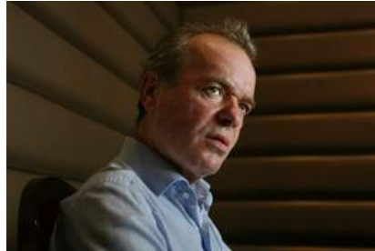
Martin Amis told the International Festival of Literature in Dubai this week that he 'respected Mohammed, not Mohammed Atta'.

It came in a staged discussion at the International Festival of Literature this week in Dubai.