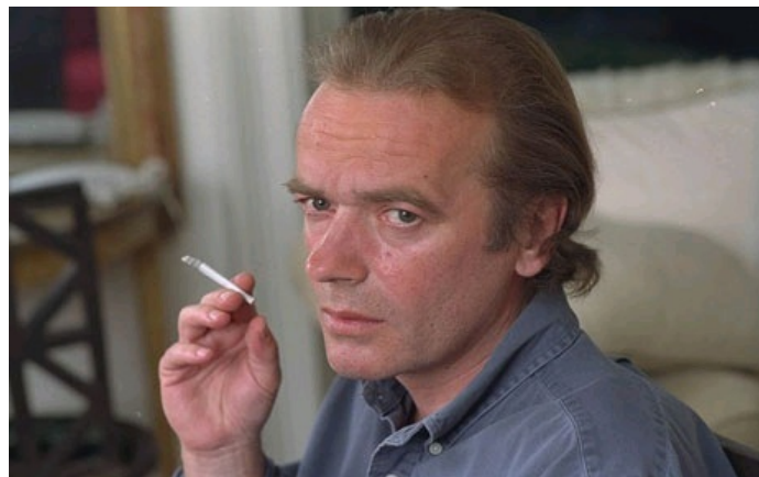
Martin Amis, whose novel Money is being filmed by the BBC.

It was rubbished for commissioning an umpteenth version of Jane Austen's Emma, but you can't say BBC Drama has taken the soft option this time. It's just announced details of a two-part literary adaptation to be shown next year: Money, by Martin Amis.