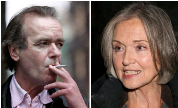
The row smoulders on... Martin Amis and Anna Ford.

The Guardian, Friday 26 February 2010 Article history