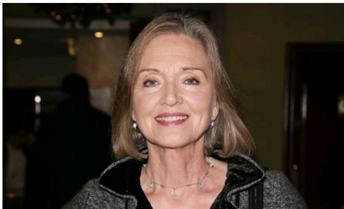
Anna Ford: agrees it was Christopher Hitchens who 'fugged up the room so densely with cigarette smoke I had to open the window'.